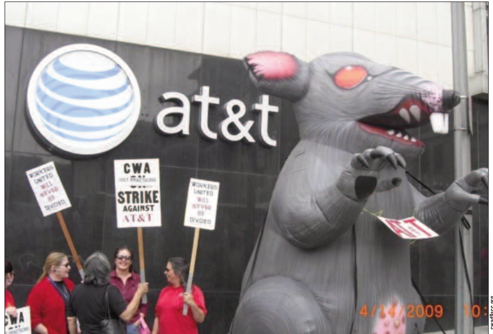
CWA union bosses across the country have used an inflatable rat and other far uglier tactics to browbeat AT&T into selling out its workers.

CWA union lawyers attempted to block the employee-initiated election because the request for the election was not made within the 45-day window period. However, the NLRB regional director in Seattle rejected the union lawyers’ tactics because the employees