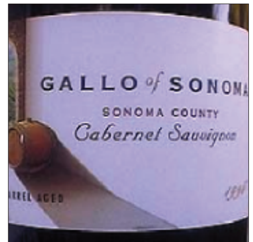
UFW union bosses are circumventing Gallo grape pickers' ability to expel the unwanted union.