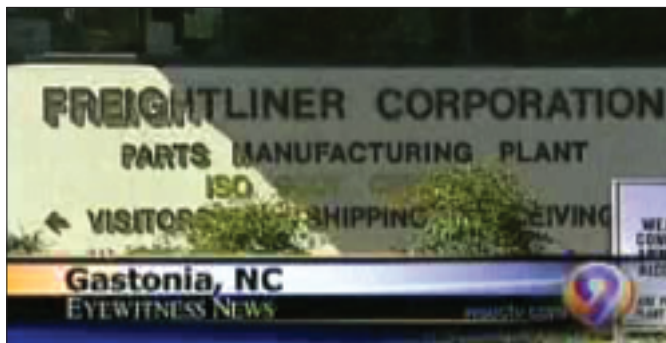
North and South Carolina television stations ran several news stories about the workers’ suit against UAW union bosses’ illegal deal with Freightliner.

In a symbolic gesture to show that the workers would no longer be intimidated by the notoriously violent UAW union, the employees announced their racketeering lawsuit outside the union’s national headquarters in economically devastated Detroit, Michigan—the hub