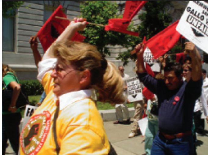
UFW union militants are serial lawbreakers: In 2003, Foundation attorneys spurred their prosecution for ordering the mass firings of over 100 berry pickers.