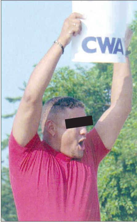
CWA union militants like the one pictured above must now cough up as much as $70 million.

Court says 71,000 communications workers due refund