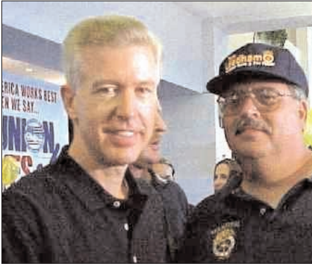
As payback for crucial election support, Governor Gray Davis (left) gave union bosses the power to extract millions from state workers.

Union officials must return more than $3 million in illegally seized dues