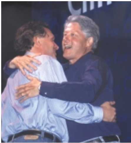
DNC boss Terry McAuliffe, seen here embracing Bill Clinton, has been tied to the Teamsters money laundering scandal.

Selection of McAuliffe as DNC's bagman a slap in the face to working Americans