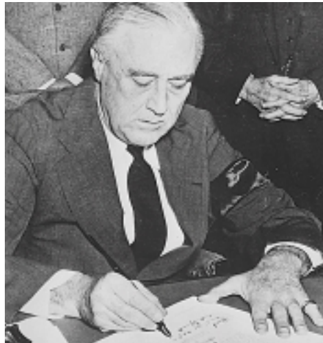
President George W. Bush could tear down the forced unionism regime erected by Franklin D. Roosevelt.

History teaches that attempts to create new bureaucracies to regulate